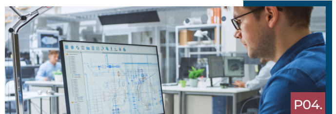
Life Sciences Research & Diagnostics: Sales